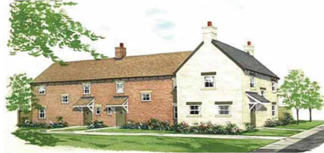
Artist's impression of new homes

bpha is committed to open and genuine consultations that involve the people most affected by its building programme in Mawsley.