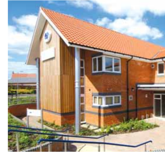
Mawsley Village Surgery

bpha is a flexible and positive partner that is committed to making a genuine difference to people's quality of life.