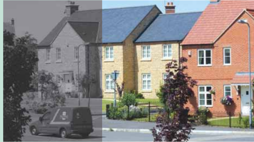
Good design has been key

bpha has so far completed two phases of building work to provide 47 affordable homes in Mawsley.