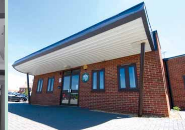
The village's new school

Mawsley village is more than just about housing. It's a real community in the making.